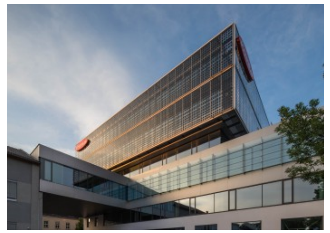
BIPV South-West façades