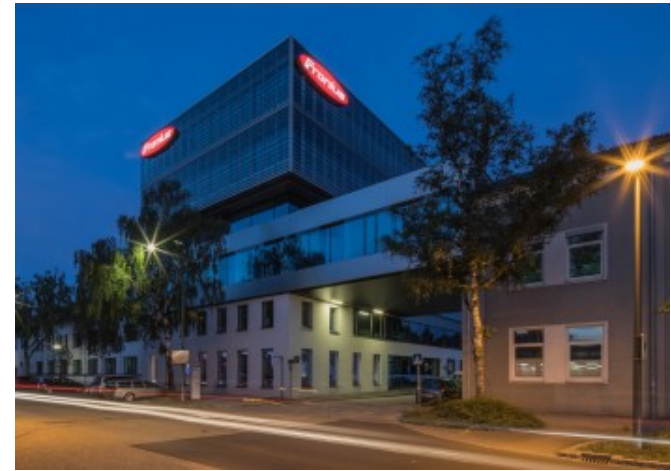
Dummy modules on the North façade