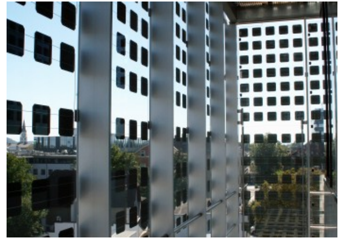
BIPV façade from the inside