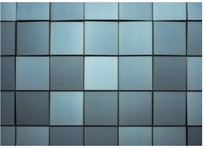
Close-up of the façade: the colours are depending on the angle of the module © C.F. Møller Architects / Adam Mørk