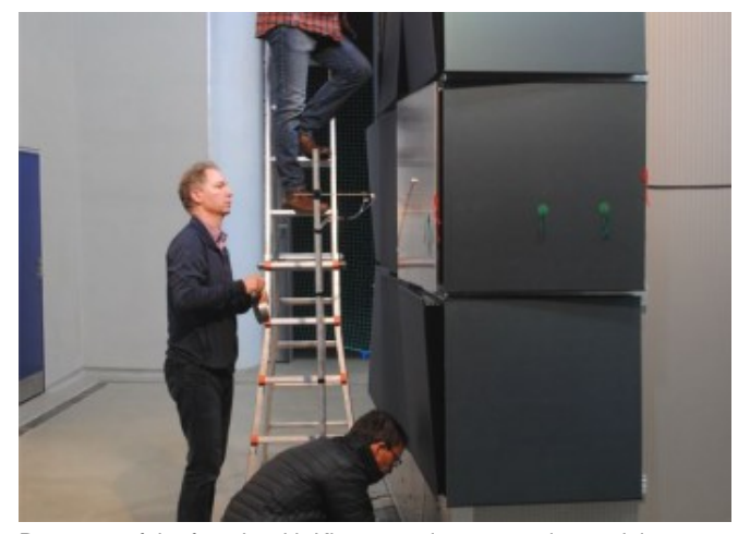
Prototype of the façade with Kingspan elements, solar modules, mounting system with brackets and rails, silicon joints, was built for tests