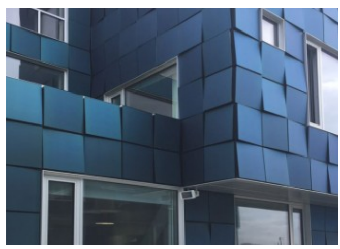
Detail of BIPV façade