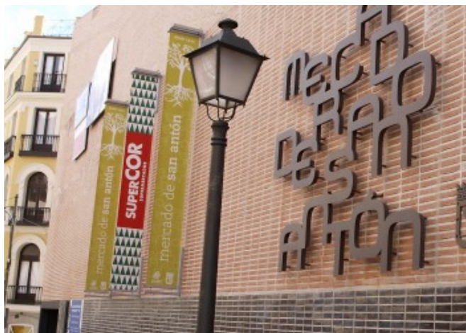
San Anton Market in the centre of Madrid © Onyx Solar