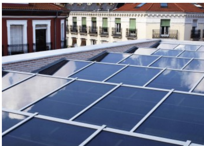
BIPV roof from the outside