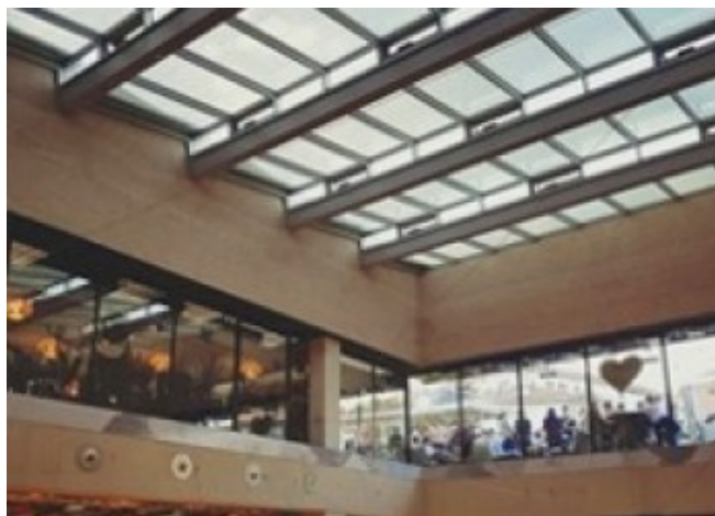
San Anton Market local meeting point, including a market of perishable goods, bars and restaurants