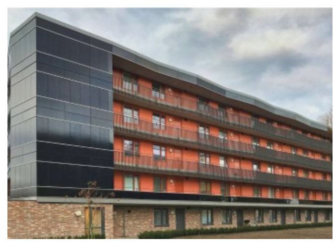
North-East façade with partly BIPV (left side)