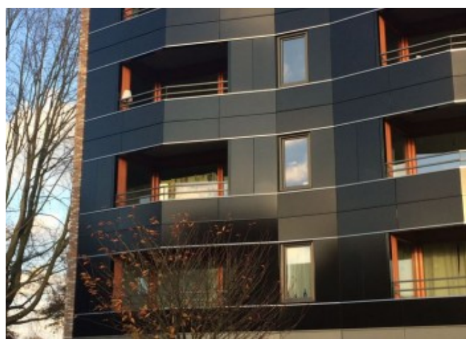
BIPV façade with standard modules © BEAR-iD