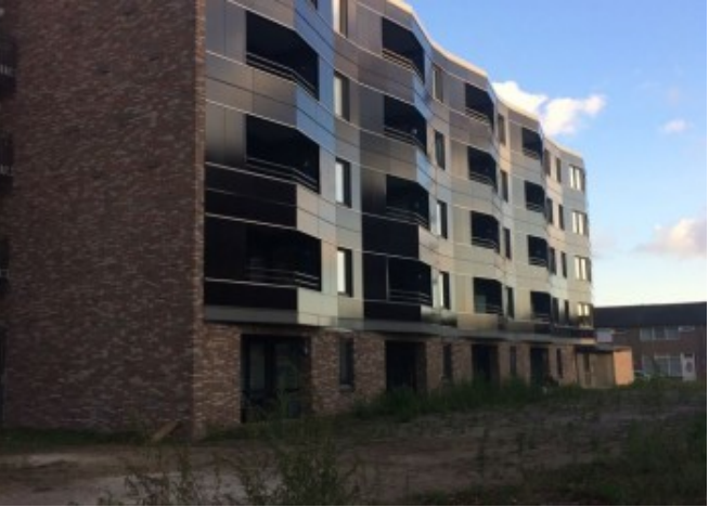
BIPV façade in the late afternoon