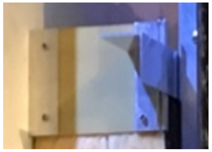
Construction detail with cavity and thermal insulation